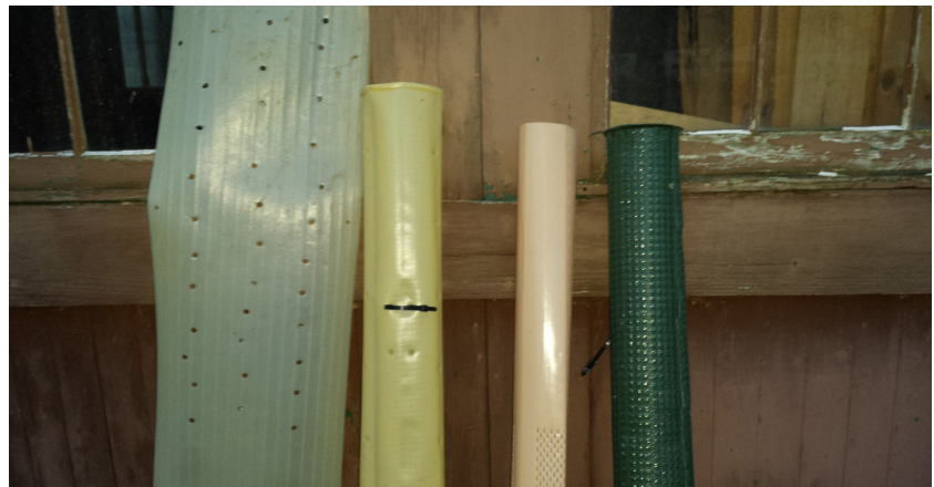
Figure 6. Examples of four tube types, both cylindrical and flat designs, the latter being assembled into a cylinder. All are 5 ft tall. Not presence of air-ventilation holes to reduce accumulation of hot air.