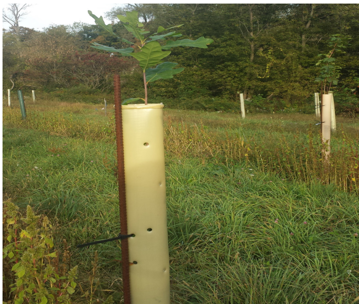
Figure 7. A tree tube design illustrating ventilation holes to reduce accumulation of hot air.