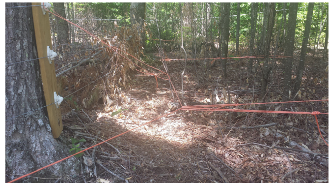
Figure 17. Baling twine attached around perimeter of fence.