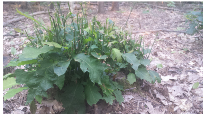
Figure 1. Browse impact of deer on stump sprouts.