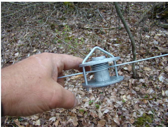
Figure 14. In-line tensioners used to tighten the 12 gauge wire.