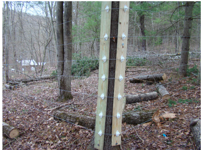
Figure 16. On abrupt corners, double batten boards may be necessary to protect the tree. Abrupt corners increase resistance when pulling wire around perimeter.

Note - research since the development of this fact sheet indicates that high-tensile fencing as described here is largely ineffective. We recommend using the plastic mesh fence. Maintenance of the fence is essential. An update fact sheet is being developed.