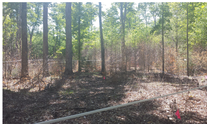
Figure 10. Enclosed area treated with herbicides to control interfering vegetation.