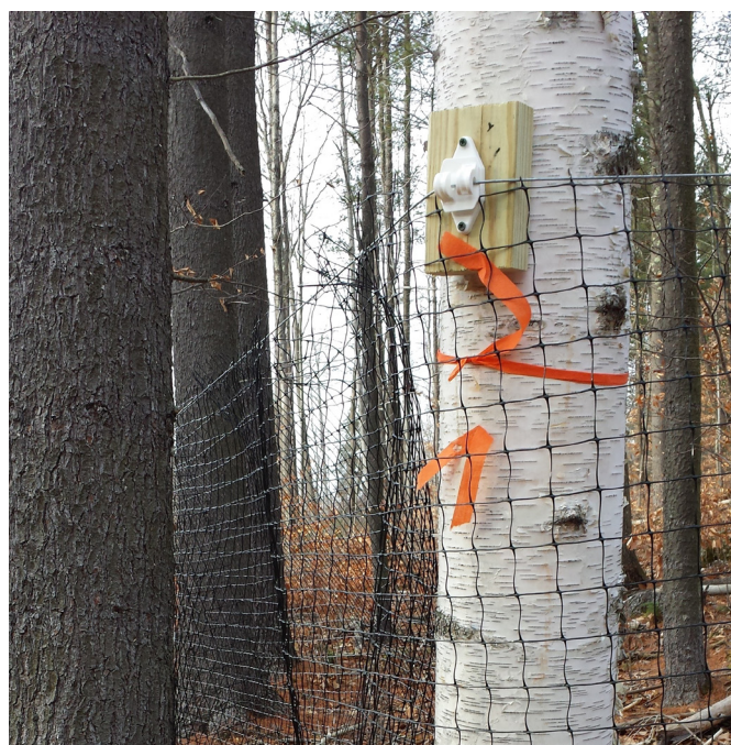
Figure 11. Flagging on paper birch identified this tree as a "fence post" tree.