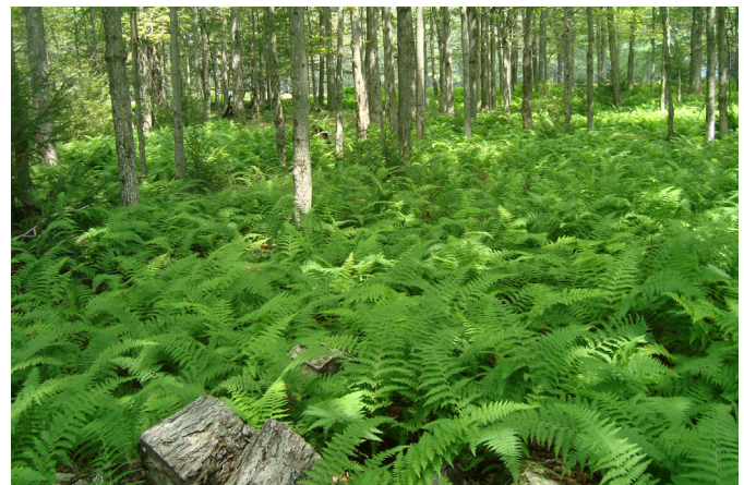
Figure 4. Ferns often dominate in areas with high deer pressure, and can interfere with natural regeneration of desired trees.