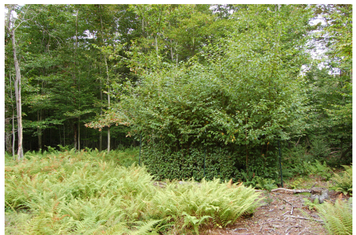
Figure 2. Small exclosures are simple and relatively inexpensive tools to assess the impacts that deer have on forest vegetation. By excluding deer, vegetation may be able to respond and illustrate the intensity of deer browsing.