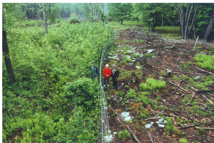
Figure 9. For large areas such as this regeneration cut, a fence is most cost effective, as shown on this 4 – 5 year old regeneration cut in Pennsylvania. With high deer pressure, the effectiveness of these fences can be dramatic.

management around the tube or cage is necessary to improve seedling growth, and will limit habitat for rodents that might girdle the seedling.