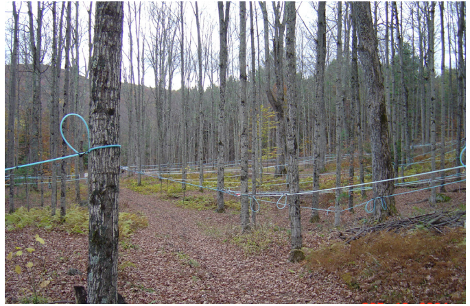
Figure 3. An open, park-like understory in this sugarbush is a combination of too much shade and too many deer.