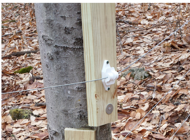
Figure 12. Batten strips can be custom fit as needed to tree shapes.